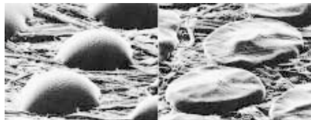
Figure 2—Left: Phase-change ink drops on the surface of a bond paper. Right: Phase-change ink drops after being fused by cold pressure rollers. 5

Bisamide modified wax brings an increase in clearness and adhesive properties of the ink composition. Thus, when images are actually printed using the hot melt ink composition containing the bisamide wax, sharp images with a good print quality can be achieved on usual print-